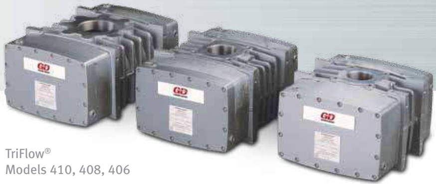
TriFlow® Models 410, 408, 406