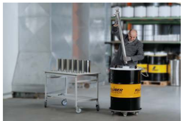
Quick to install with few components.