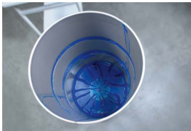
Emptying of drums to less than 1 % residue.

Other variants of the VISCOFLUX family: VISCOFLUX and VISCOFLUX mobile for transferring high-viscous substances just not capable of flowing (see separate brochures).