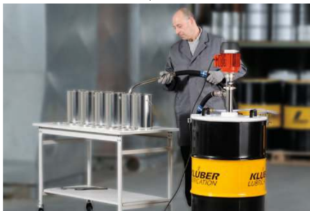
Filling of high-temperature lubricating grease.